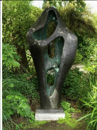
Figure for Landscape (1960)