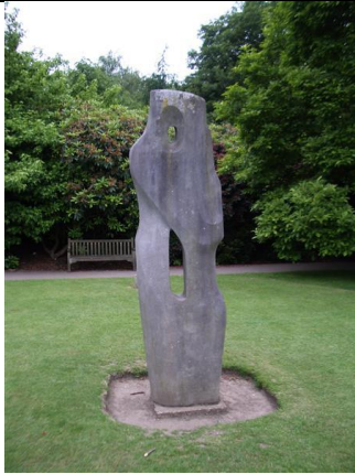
Monolith - Empyrean (1953)

To learn about the work of a range of artists, craft makers and designers, describing the differences and similarities between different practices and disciplines, and making links to their own work.