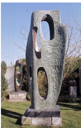
Rock Form (1964)